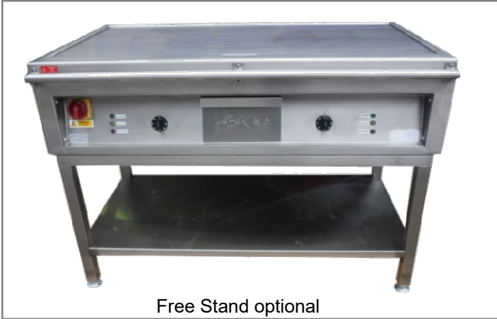
Free Stand optional