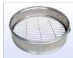
Steamer tray (with removable wire mesh base)