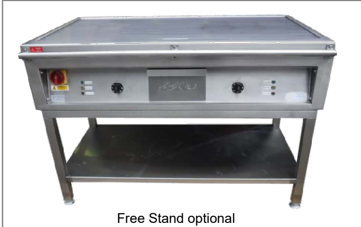
Free Stand optional