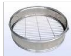
Steamer tray (with removable wire mesh base)