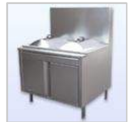
Rice Roll Steamer – Double