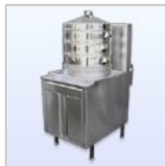
Steam Tray Steamer