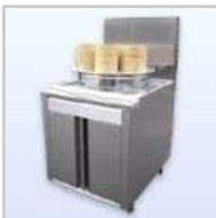
Bamboo Dim Sum Steamer