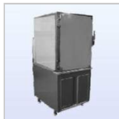
Single Door Steamer