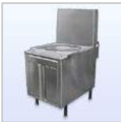
Steamer Boiler Base Unit