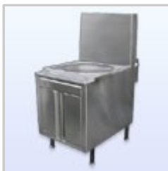
Steamer Boiler Base Unit