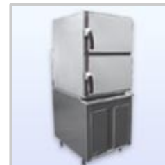
Double Door Steamer