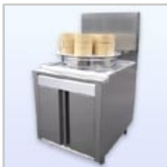
Bamboo Dim Sum Steamer