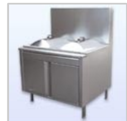
Rice Roll Steamer – Double