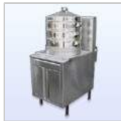
Steam Tray Steamer