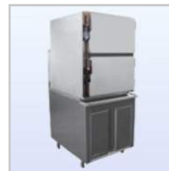
Double Door Steamer