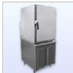
Single Door Steamer