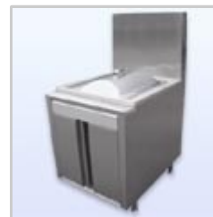
Rice Roll Steamer - Single