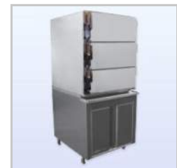
Triple Door Steamer