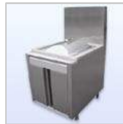
Rice Roll Steamer - Single